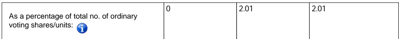
Table 3. Change in respect of rights/options/warrants over shares/units of Listed Issuer